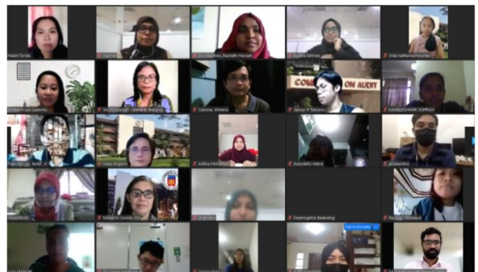
Batch 2: Participants of International Webinar on 07 th September, 2021