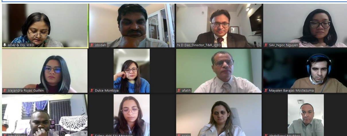
Participants during International Webinar on “Multi-dimensional Aspects of Auditing Blue Economy” 14 th July 2023 (Batch-II)